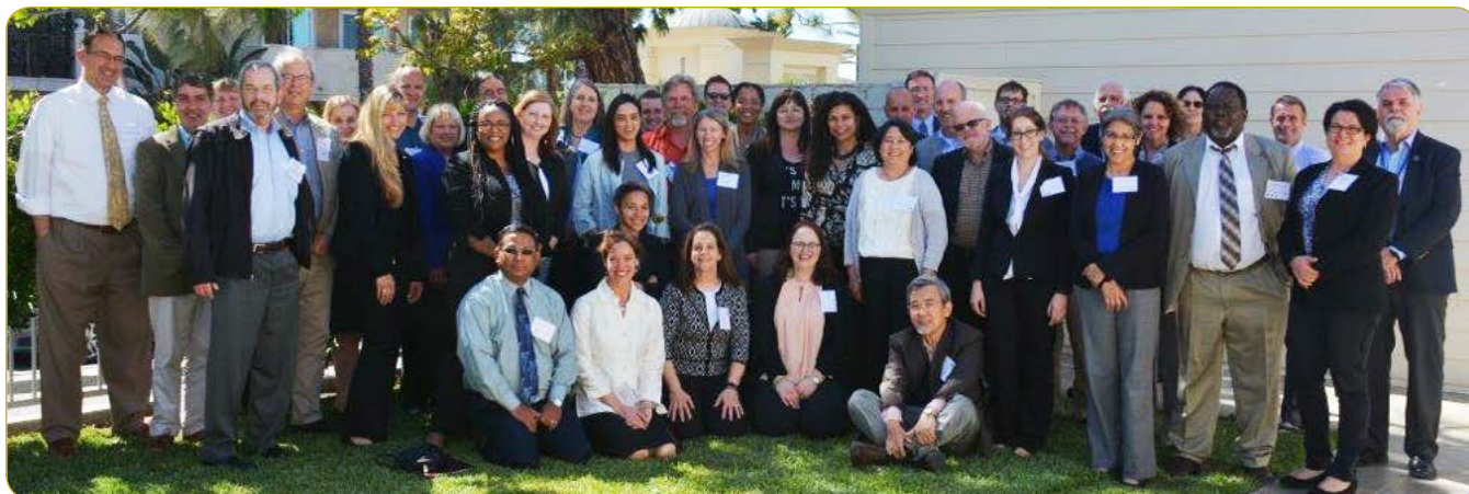
ORI-LMU meeting attendees representing NIH, NSF, OHRP, OLAW, ORI, and institutions of higher learning in the U.S. and abroad