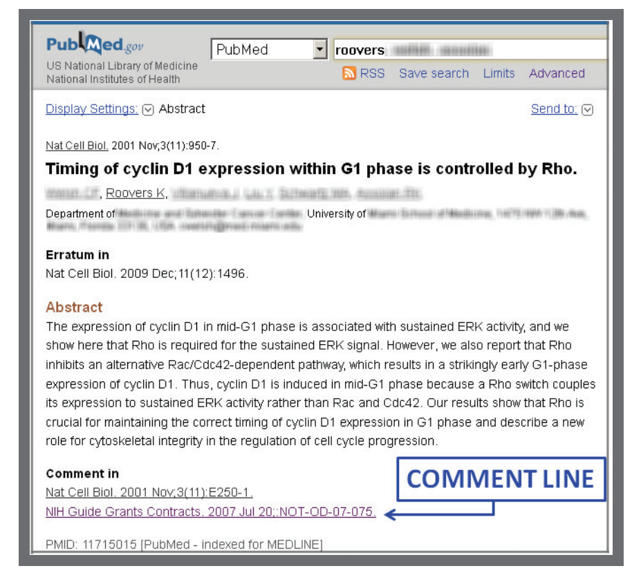
FIGURE 1: Results of a PubMed search for a non-retracted paper that was cited in an FRN for Research Misconduct. This "boxed" annotation indicates the addition of a "Comment" line that is not usually present.